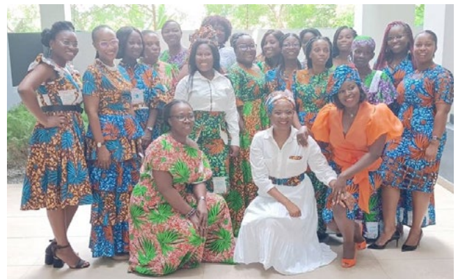
OLEA Côte d'Ivoire